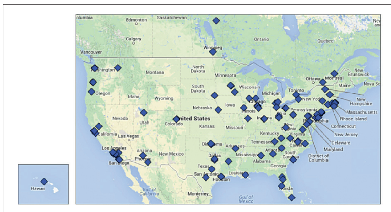
Figure 1. Site summary for the BEST-CLI trial. At the time of this writing, 92 of the selected sites have been activated. Figure and personal communication courtesy of Alik Farber, MD.

Not surprisingly, the BEST-CLI trial also has limitations, largely arising from the heterogeneity of patients and procedures that characterize current CLI practice. Despite its limitations, BEST-CLI represents a critical opportunity to collect high-quality, multicenter data from a randomized trial. Ultimately, more than one